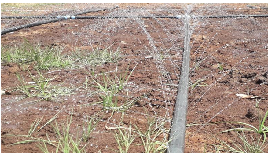
Figure 2. Micro rain pipe on test

Christiansen's uniformity coefficient (CU), coefficient of variation (CV), distribution uniformity (DU) and mean application rate (MAR) were measured to estimate the hydraulic performance of rain pipe. In catch cans positioned between two rain pipes, the water released by the rain pipe was collected. The amount of water in catch cans were measured and the depth of water was converted based on the catch can's cross-sectional area.